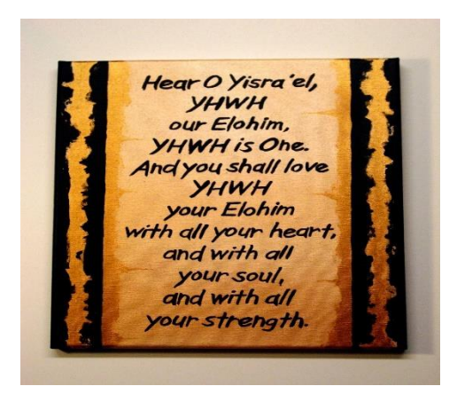
Pray the Shema

St. John United Church of Christ 10207 Lincoln Trail, Fairview Heights, IL 397-6323