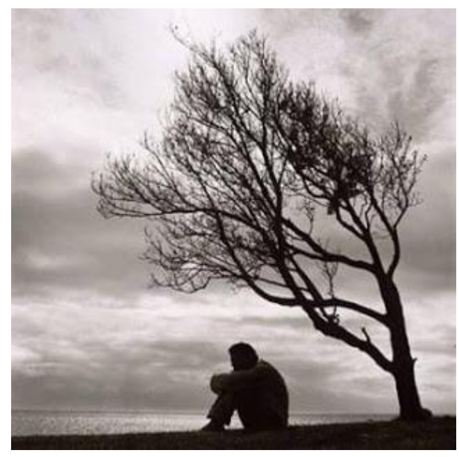
A sacred time for Lament.

Genesis 22:1-14 Psalm 13 Romans 6:12-23 Matthew 10:40-42